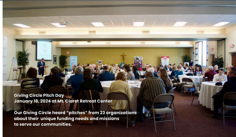
Giving Circle Pitch Day January 18, 2024 at Mt. Clare Retreat Center

Thankfully, we at the Foundation are equipped to take on this task - to help ensure the teachings of the Catholic Faith are passed on from generation to generation through the financial support from you, our community of donors. We continue to monitor giving trends both in the Diocese of Phoenix and nationwide, recognizing a significant reliance on contributions from the faithful aged 68-80, who are a major part of our donor base in the Diocese. This prompts us to reflect on whether the next generation will fill those shoes, or if we face a deeper issue. The economic strain of inflation and changing attitudes towards faith are pressing concerns.