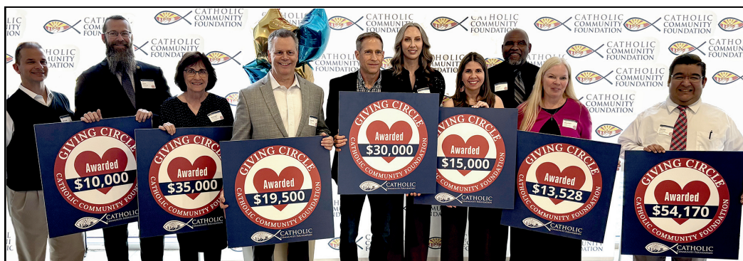
(2025 Giving Circle Grant Recipients. L to R) Andre House Hospitality, St. Catherine of Siena Catholic School, Arizona Life Coalition, St. Joseph the Worker, St. Mary-Basha Catholic School, St. Timothy Catholic School, and St. John Paul II Catholic High School.